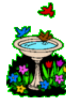
- Trisha Added: Oct. 14, 2014

Photos may be scaled. Click on image for full size.