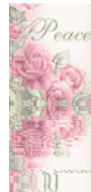
- Trisha Added: Oct. 13, 2013