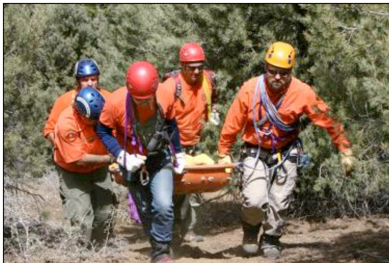
Kern County Sheriff's Search and Rescue team members bring the young man's body up from approximately 700 feet below the cliff where he fell the night before.