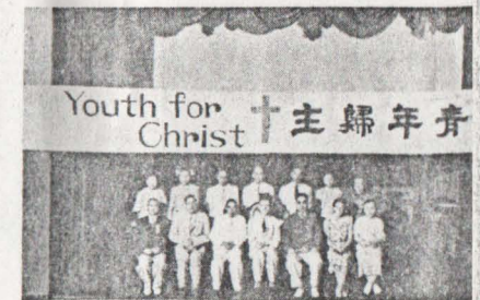
A committee, composed mostly of native Christians, guides the rally's business and programming affairs.