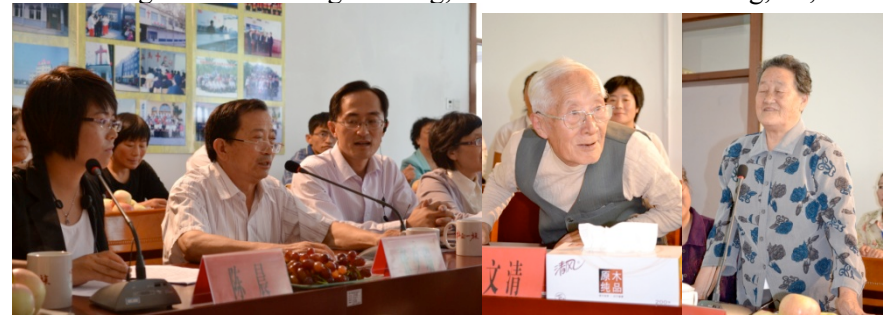
Church Leaders in Zhucheng