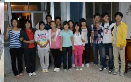
Some students at the Bible School in Gaomi